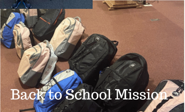
Back to School Mission