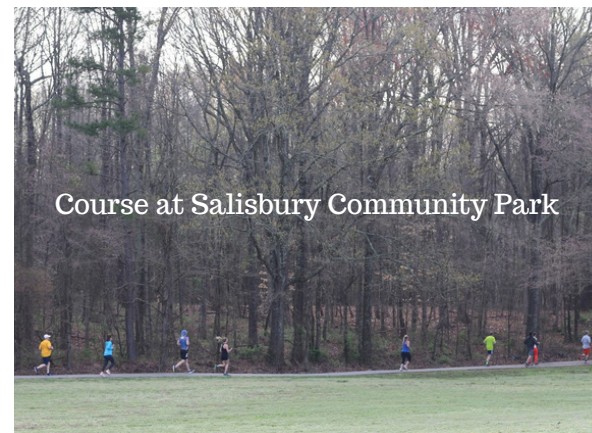
Course at Salisbury Community Park

All funds raised are used to support missions (local and abroad) • Feeding the Homeless • Back to School Supplies • Toy Drives • Pregnancy Support • Local Outreach Events