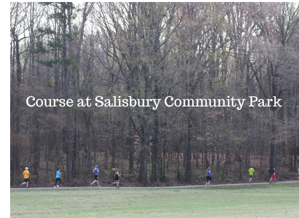
Course at Salisbury Community Park