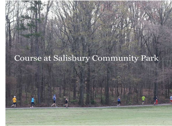
Course at Salisbury Community Park

40 "The King will reply, 'Truly I tell you, whatever you did for one of the least of these brothers and sisters of mine, you did for me.' Mat 25:40