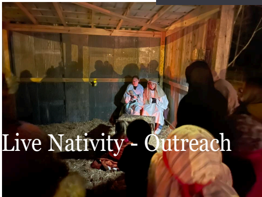
Live Nativity - Outreach